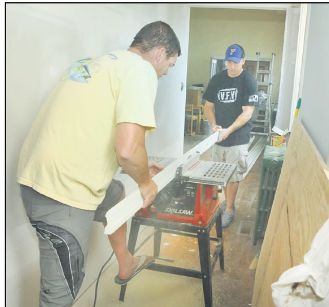
Bob Esposito / Town and Country